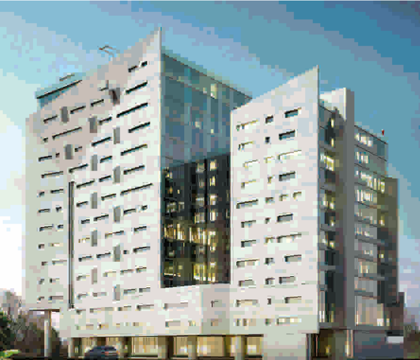
SPRINGHILL OFFICE SWISS-BELINN SPRINGHILL HOTEL