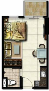
UNIT STUDIO - B (A1 & A2) SEMI GROSS = 37,96 m 2