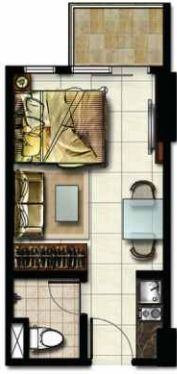
UNIT STUDIO - A (F & M) SEMI GROSS = 32,96 m 2