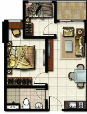
UNIT 2BR - A (B, I & G) SEMI GROSS = 58,23 m 2