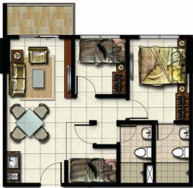
UNIT 3BR (C & J) SEMI GROSS = 73,66 m 2