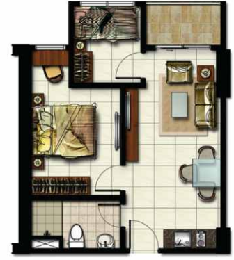
UNIT 2BR - B (N & H) SEMI GROSS = 60,88 m 2