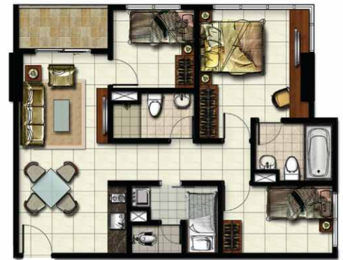
UNIT 3BR + Maid (D, E, K & L) SEMI GROSS = 99,67 m 2